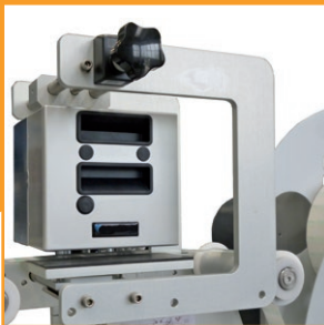
Thermal transfer printers

Two hybrid step-motors low-loss A++ Class Mechanical unwinder d. 400 mm Motorized rewinder d. 350 mm Stop photocell End of roll alarm Encoder in-put Touch Screen operator panel Offset and start delay adjustment Automatic recovery of missing label Applied label counter Setting memorization