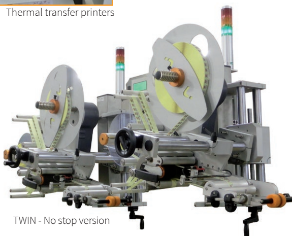
TWIN - No stop version