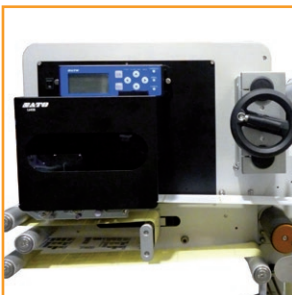
Thermal transfer printers